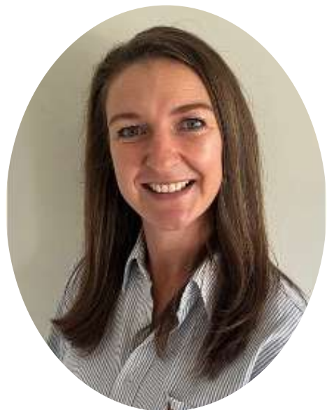
Y5 - C

While teaching, I endeavour to support and provide for children with varying ability levels within the classroom. To this end, I aim to challenge students who need to be extended while providing the necessary time and support to students who need this extra support. Working in collaboration with parents is also essential in order to maximise the progress of the students I teach. I have been teaching in the UAE for the past two years and am excited to be a part of the team at Noya British School.