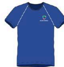
P.E. T-Shirt Boys & Girls | FS1 - Year 13 Compulsory AED 107-135