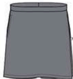
Grey Skort Girls | FS1 - FS2 Optional AED 135