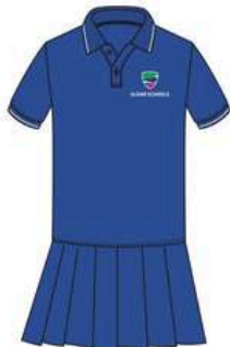
Dress Girls | FS1 - FS2 Compulsory AED 149