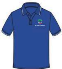
Polo T-Shirt Boys | Year 1 - Year 6 Compulsory AED 111-130