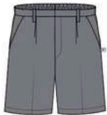
Grey Short Boys | FS1 - FS2 Compulsory AED 107-123