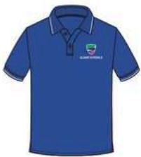
Polo T-Shirt Boys | FS1 - FS2 Compulsory AED 111-130