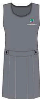
Grey Pinafore Girls | Year 1 - Year 6 Compulsory AED 141