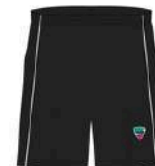
Unisex PE Shorts Boys & Girls | FS1 - Year 13 Compulsory AED 107-130