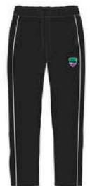
P.E. Track Pants Boys & Girls | FS1 - Year 13 Optional AED 141