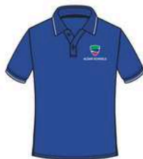
Polo T-Shirt Girls | Year 1 - Year 6 Optional AED 111-130