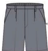
Grey Short Boys | Year 1 - Year 6 Compulsory AED 107-123