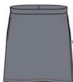
Grey Skort Girls | Year 1 - Year 6 Optional AED 135