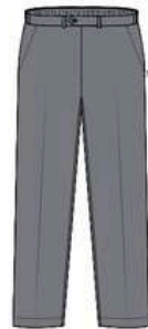
Trouser Boys & Girls | FS1 - FS2 Optional AED 121-138